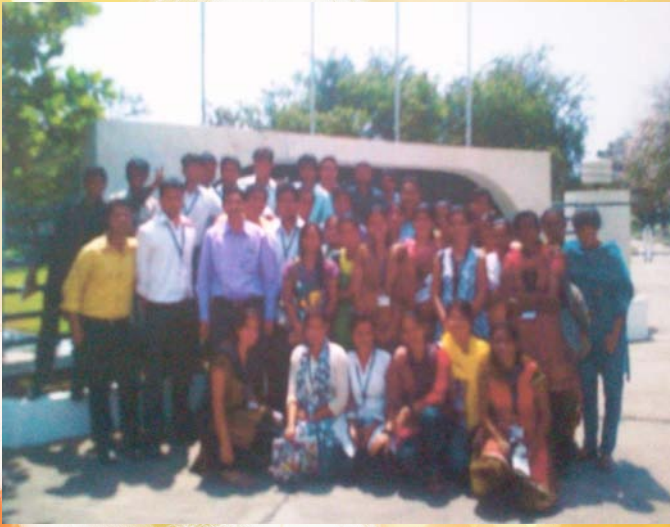
Industrial Visit at Legrand & Jain Irrigation Jalgaon