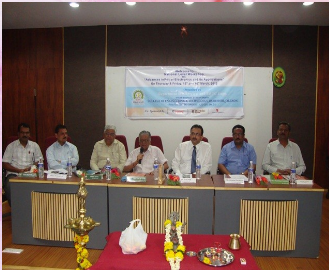
Workshop on Advances in Power Electronics & Its Application

Two day Workshop on “Advanced Advances in Power Electronics & Its Application ” was organized on 15th & 16th March 2012 in Electronics & Telecommunication Engineering department.