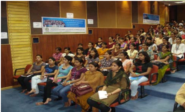
Guest Lecture In Department of E&TC