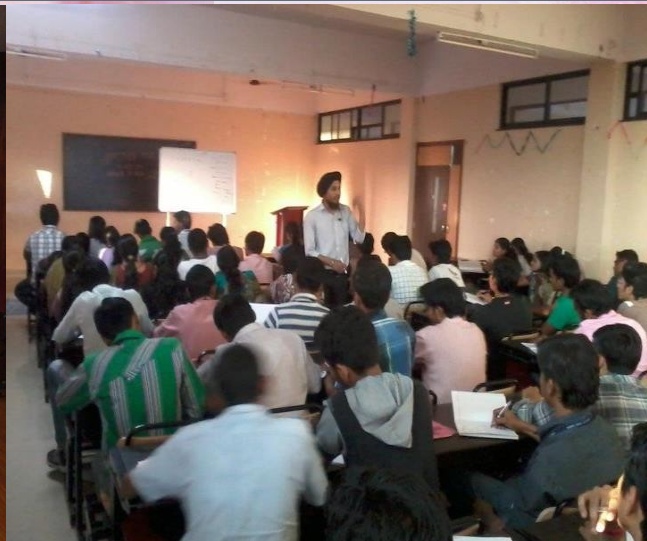
Workshop on CYBORG The Robotics Workshop